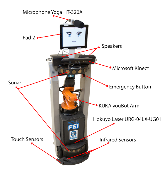
Fig. 1. RoboFEI's Judith

The robot's main computer has been an ASUS Ultrabook 14" Touch-Screen Laptop, with an Intel Core i5, 4GB Memory, 500GB Hard Drive. It has only 3 USB ports supporting all devices, so an USB hub is used to enable more ports and increase the number of interfaced devices. As the iPad needs a paid annual license for software development, a change is being made towards Android technology so as to allow us to develop an interactive face for Judith.