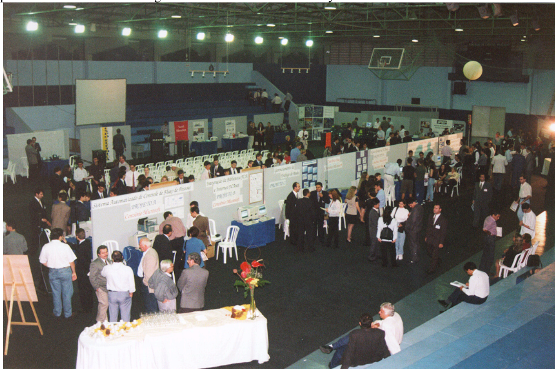
Fig.1 - View of the XII ELEXPO Exhibition

The last session of ELEXPO was held in December, 1997, and among the supporting companies were: Icatel Telemática, Novell/CNT, Bay Networks/Telsyst, Microsoft/Brás e Figueiredo, ALTERA/União Digital, HP and ACER. Out of the 13 works presented, 7 were a result of partnerships. Among these works, two were awarded a prize by the ELEXPO judging committee and deserve to be distinguished as a practical result of the partnerships. They are the “Automated System for Consumer Flux Control” and the “System for Specification and Dimensioning of ATM Networks based on Bay Networks Products”.