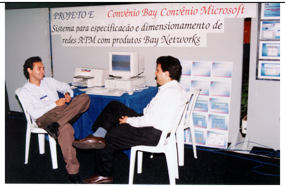
Figure 2.b: "System for specification and dimensioning of ATM base on Bay Networks products", winner of the Bay Networks Award .

The "Automated System for Consumer Flux Control" (figure 2.a) is a completely automated system for monitoring the flow of clients (entrance and exit) in the TendTudo Stores, a general department store of Alcoa Group.