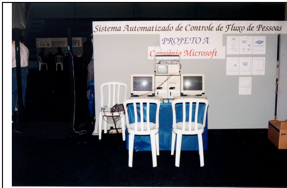
Figure 2.a: "Automated system for client flux control", winner of the Microsoft Award. The sensors can be seen at the left side of the photograph.