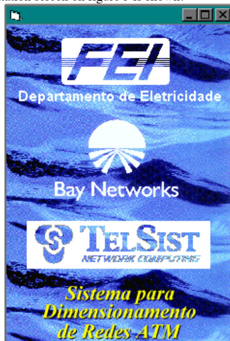
Figure 3: Presentation Screen.

As the program starts, the presentation screen on figure 3 is shown.